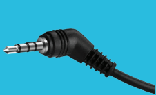
WITH 3.5 MM TRRS PLUG